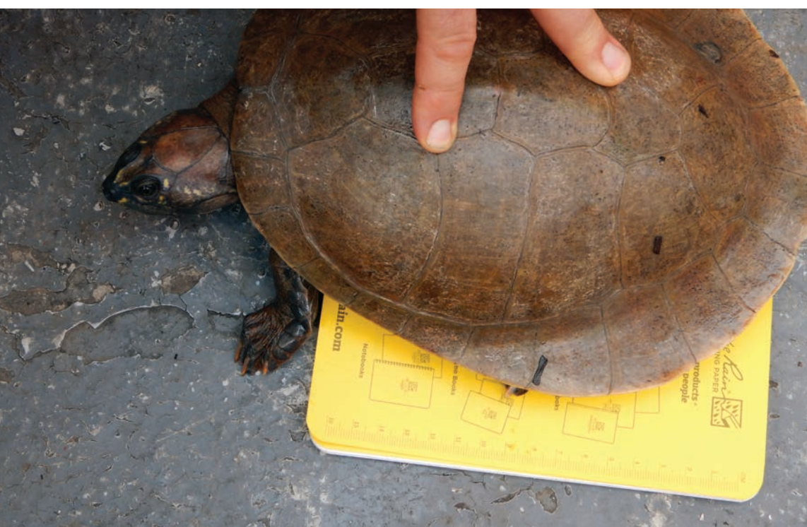
The 2015 research component was to collect data on turtles that live in the Upper Amazon (and the field guide can double as a ruler).

enthusiasm that comes from working together in the field. Every effort is made to make expenses affordable. Over the years, students have stayed in field camps with rough amenities and even on cruise ships (which are cheaper in terms of transport, food, and lodging).