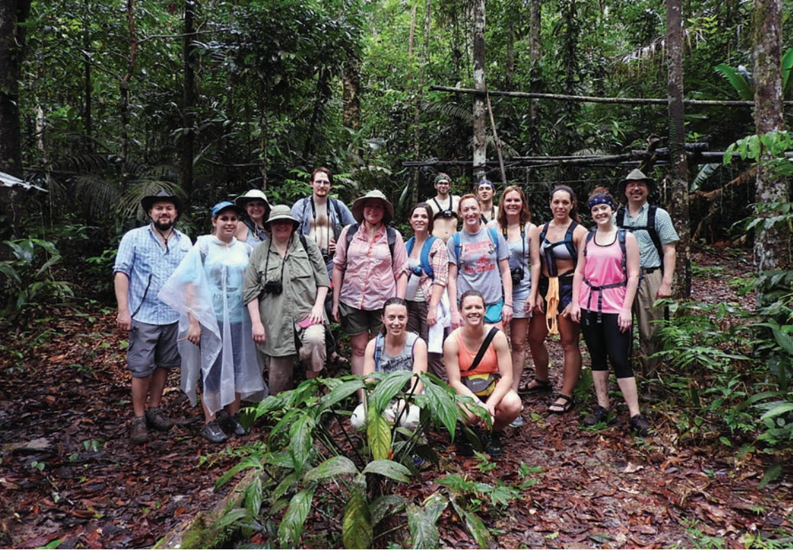
The Biology L303 class of 2015 deep in the jungle of Reserva Ducke, Amazona, Brazil