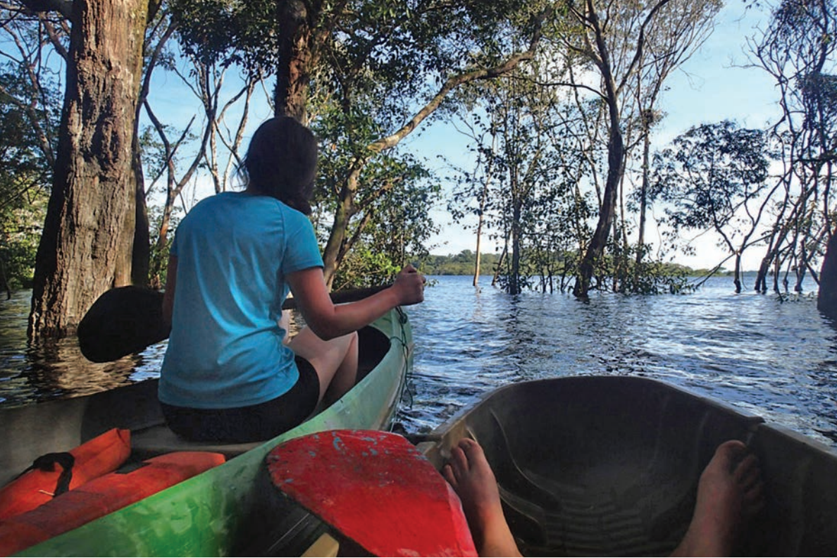
Above: Exploring the flooded forest by small boat